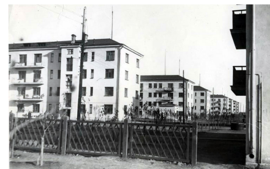
Sotsgorod ChTZ, Funds of the ChTZ Museum, 1930s