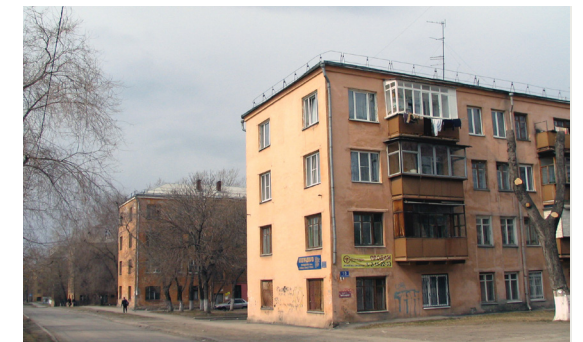
Fragment of residential development on Savina st.