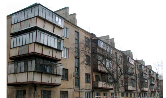
Residential building on Belostotskogo st., by E. Konyshева, 2010